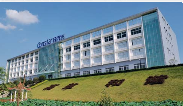
▲▼ Constar micromotor (Chongqing) Co., Ltd Located in Fuling District, Chongqing, China

KOCO DC-MOTION is a problem solver, a partner who is enthusiastic about technology and who is already at home in the future.